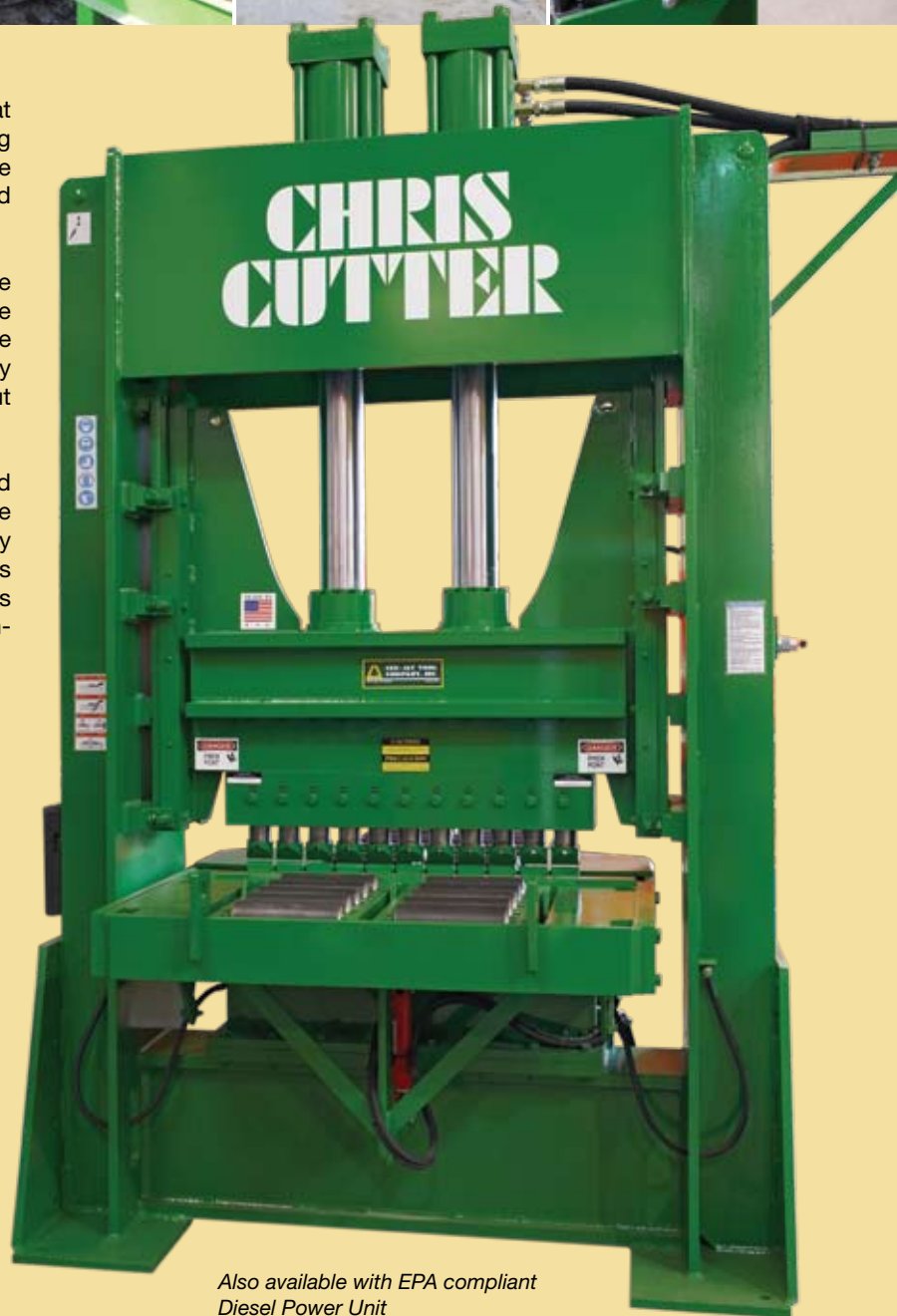
Also available with EPA compliant Diesel Power Unit

For more information call or visit: 800-350-9313 www.CeeJayTool.com